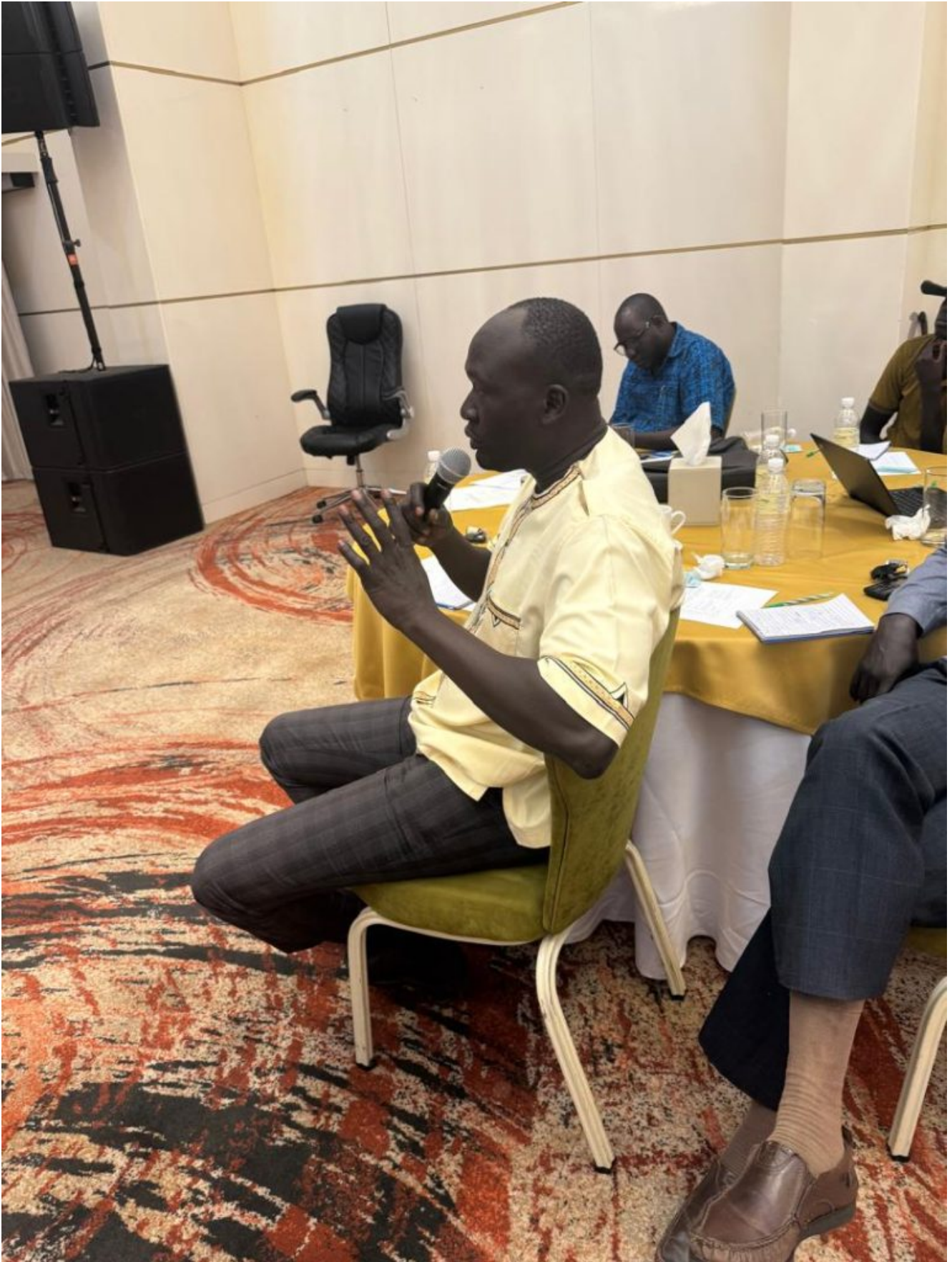
This series of stakeholder engagements form part of the Commission's action plan adopted during a retreat in Entebbe, Uganda, in December 2024. The consultative meeting was NEC's