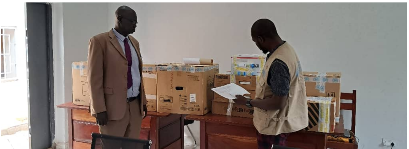
Wau – Western Bahr el Ghazal