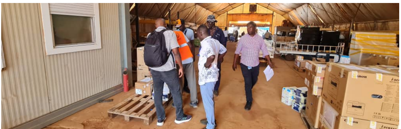
UNMISS Topping Logistics Base – Preparing to ship equipment to the States