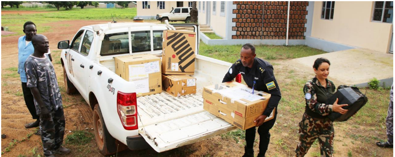
Rumbek – Lakes State

supporting the NEC and SHECs as the country prepares for the upcoming elections.