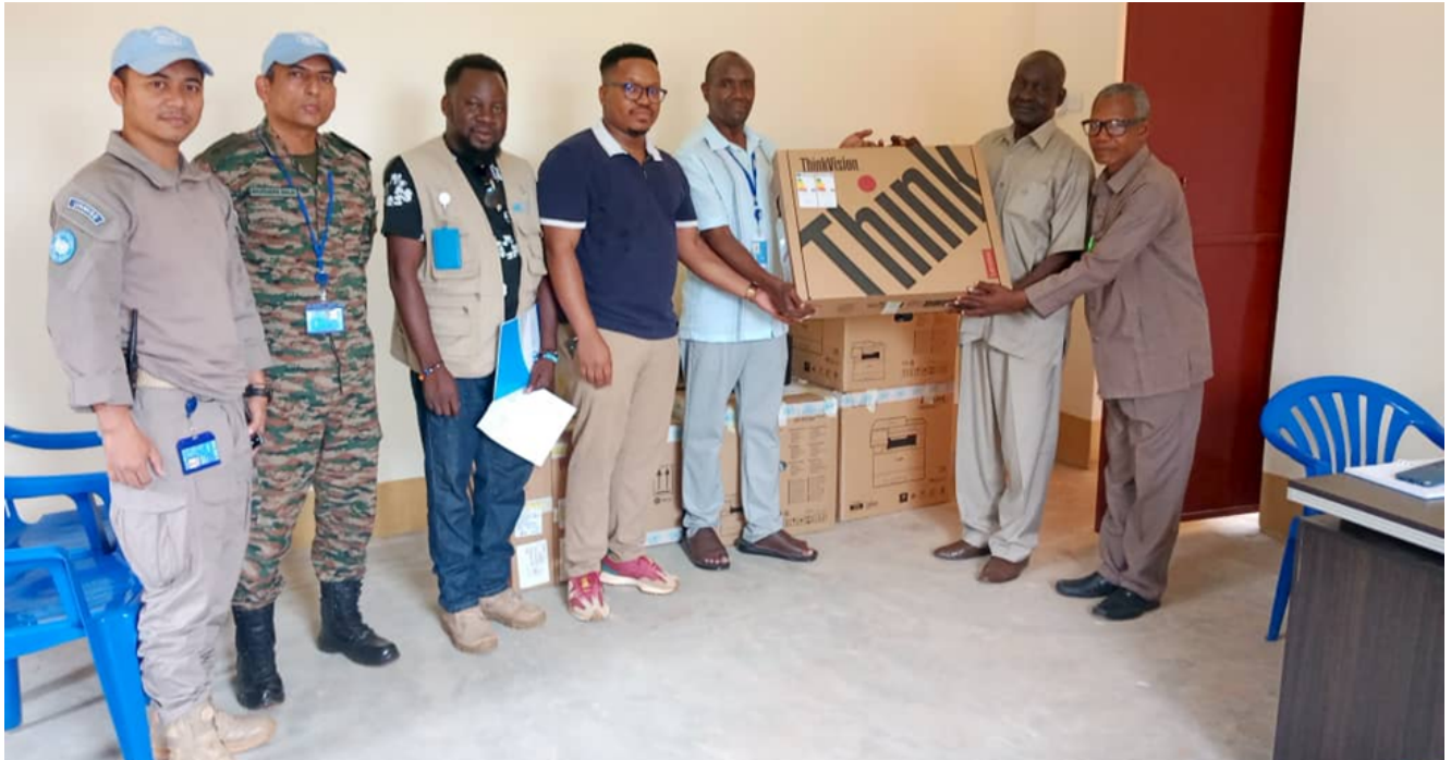
Yambio – Western Equatoria State